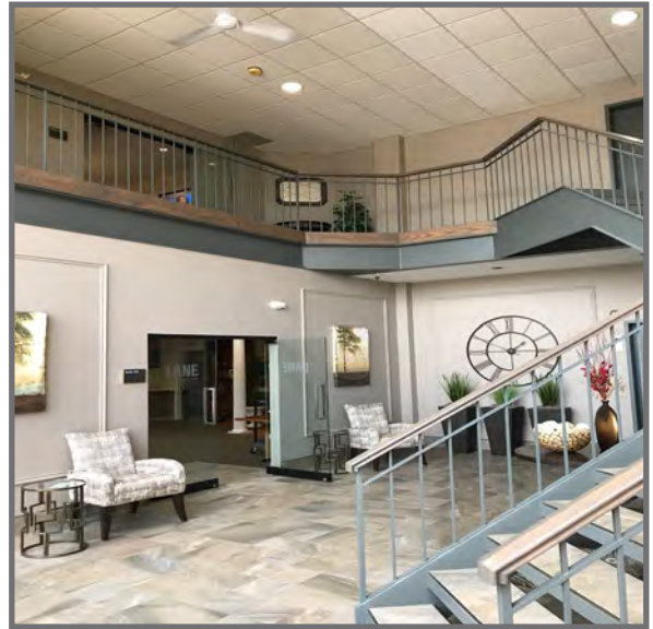
Impressive Building Lobby