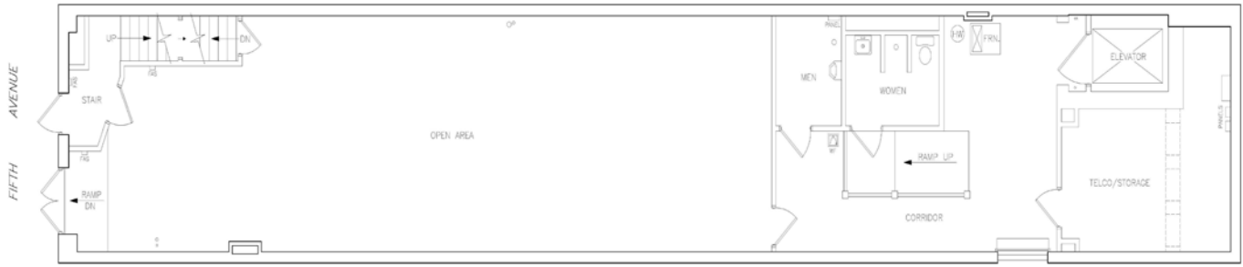
822 Fifth Avenue - First Floor