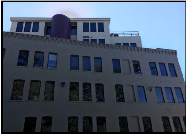
Rear Building Exterior