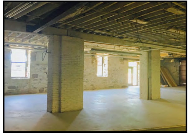
Ground Floor Exposed Tech Space