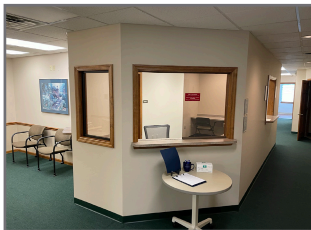
Suite 300 - Built-Out Waiting Room