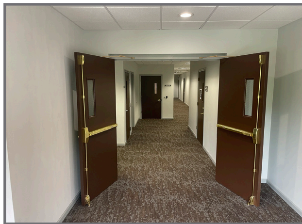
Updated Common Corridors