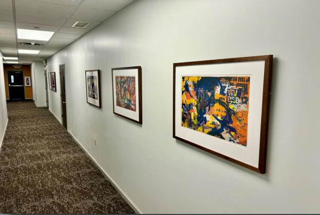
Updated Common Corridors