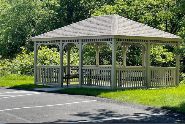
New Outdoor Gazebo