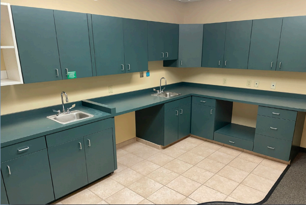
Existing Medical Support Space