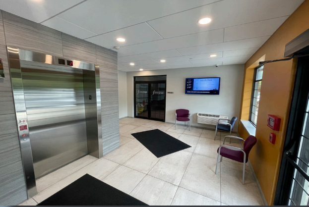
New Lobby Area