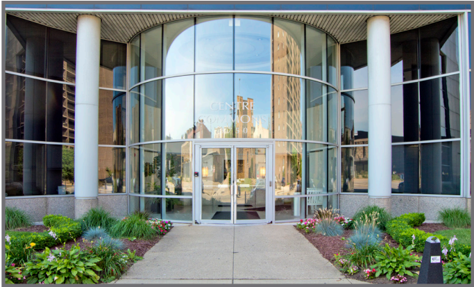
Ample On-Site / Covered Parking