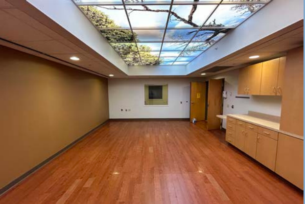
Existing CT Room (1A)