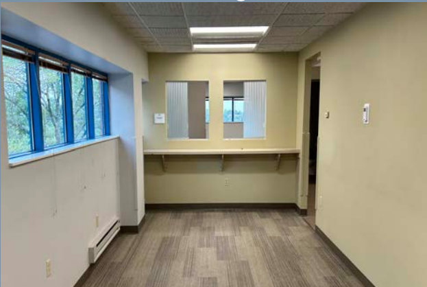
Check-In / Waiting Room (2B)