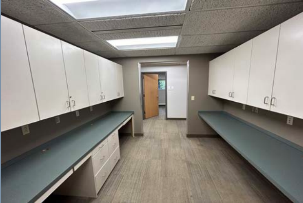
Nurses Station (2A)