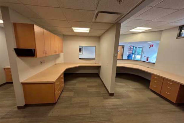
Check-In Area (1A)