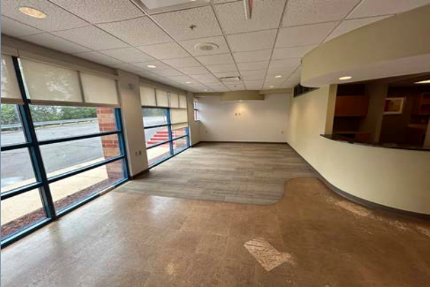
Waiting Room (1A)