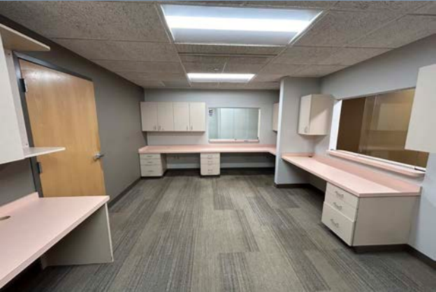
Check-In Area (1B)