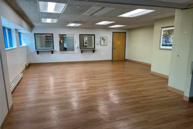
Waiting Room (2A)