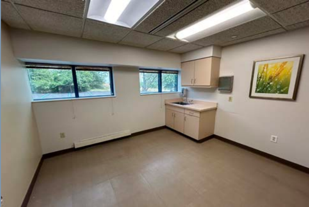
Typical Exam Room (2A)