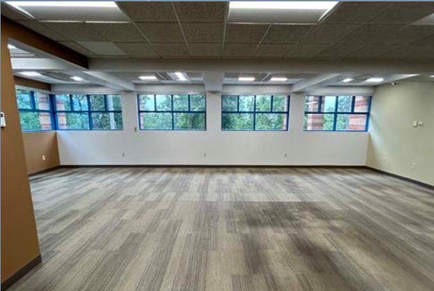
Open PT Area (1B)