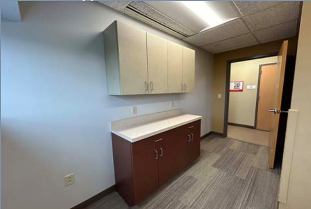
Typical Exam Room (2B)