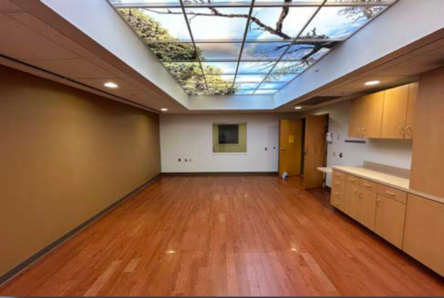
Existing CT Room (1A)