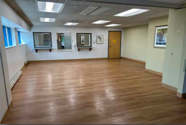
Waiting Room (2A)