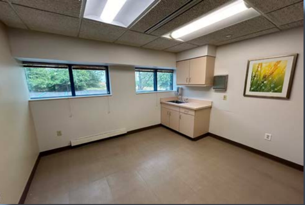
Typical Exam Room (2A)