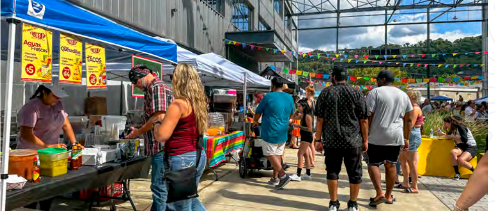
PITTSBURGH TACO FESTIVAL