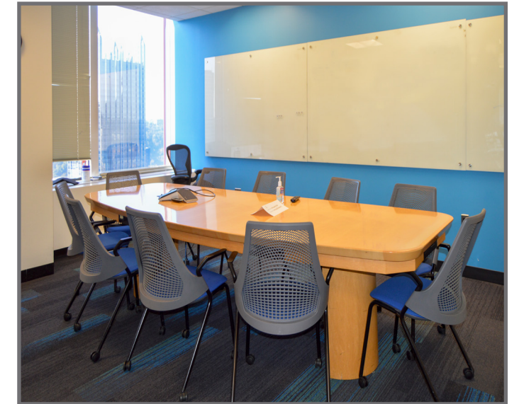
34 th Floor