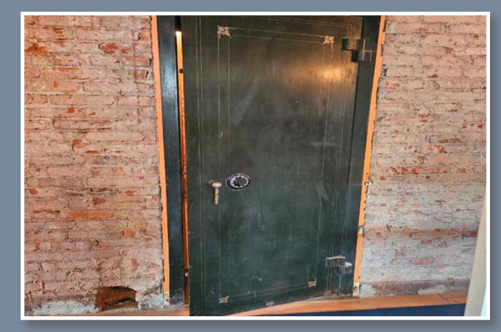
PRIVATE STORAGE VAULT