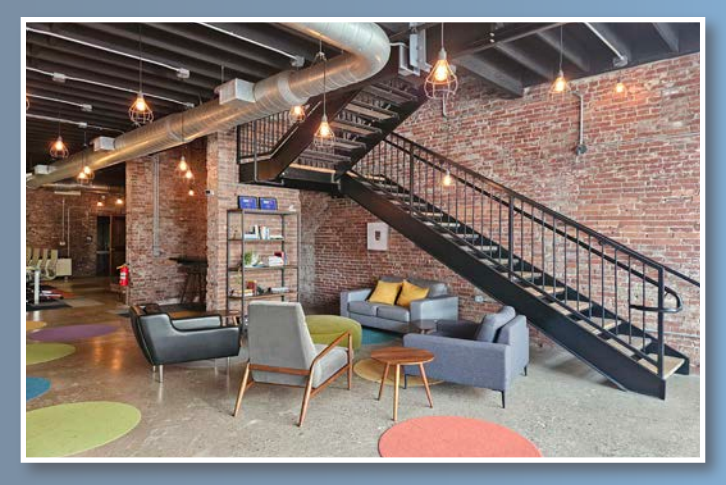
OPEN LOUNGE / WORK AREA