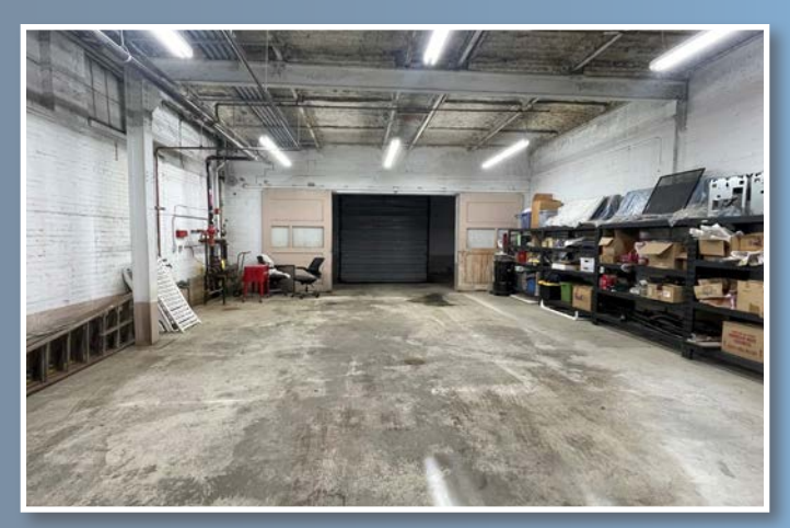
TECH / FLEX SPACE