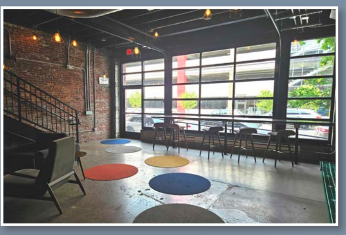
OPEN LOUNGE / WORK AREA